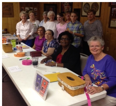
The C.A.R.E. Center’s Bingo fundraiser was a great success and proceeds will directly benefit their cause.