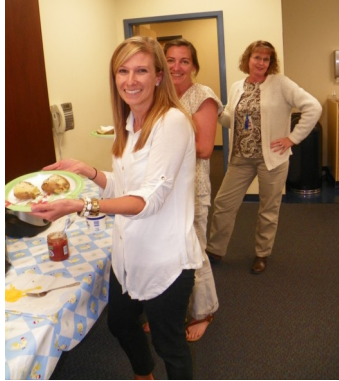
Everyone enjoyed all the fixins’ at the Baked Potato Bar hosted by the EAC!