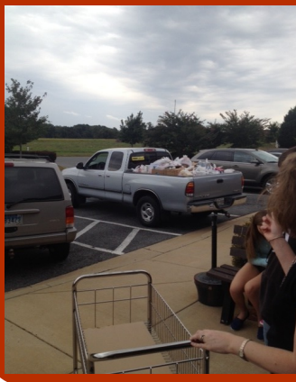
One of 2 truck-loads of food donated by the community to benefit residents of Queen Anne’s County.

From September 15 through 29, 2013, Marylanders joined their neighbors in Virginia, West Virginia, and D.C. for Day to Serve events that recognize the connections between the health of our people, the health of our land, water and air, and the importance of taking action in something bigger than ourselves. From food drives to stream repair and highway clean ups, Marylanders worked