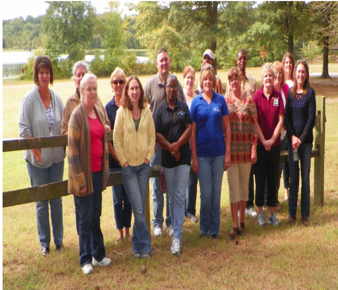
Child Support Assistant Directors, Supervisors, and caseworkers from 3 counties took a timeout from all the fun to gather for a group photo!

Child Support caseworkers and staff across 3 counties gathered together for a Staff Picnic on September 27, 2013 at Tuckahoe State Park in Queen Anne, MD. Child Support workers from Caroline, Kent, and Queen Anne's County came together in celebration of August's Child Support Awareness Month and bonded over a pot-luck lunch